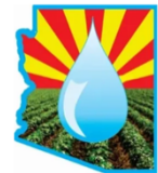
Agribusiness & Water Council of Arizona