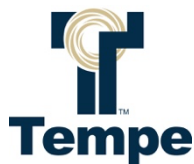
City of Tempe